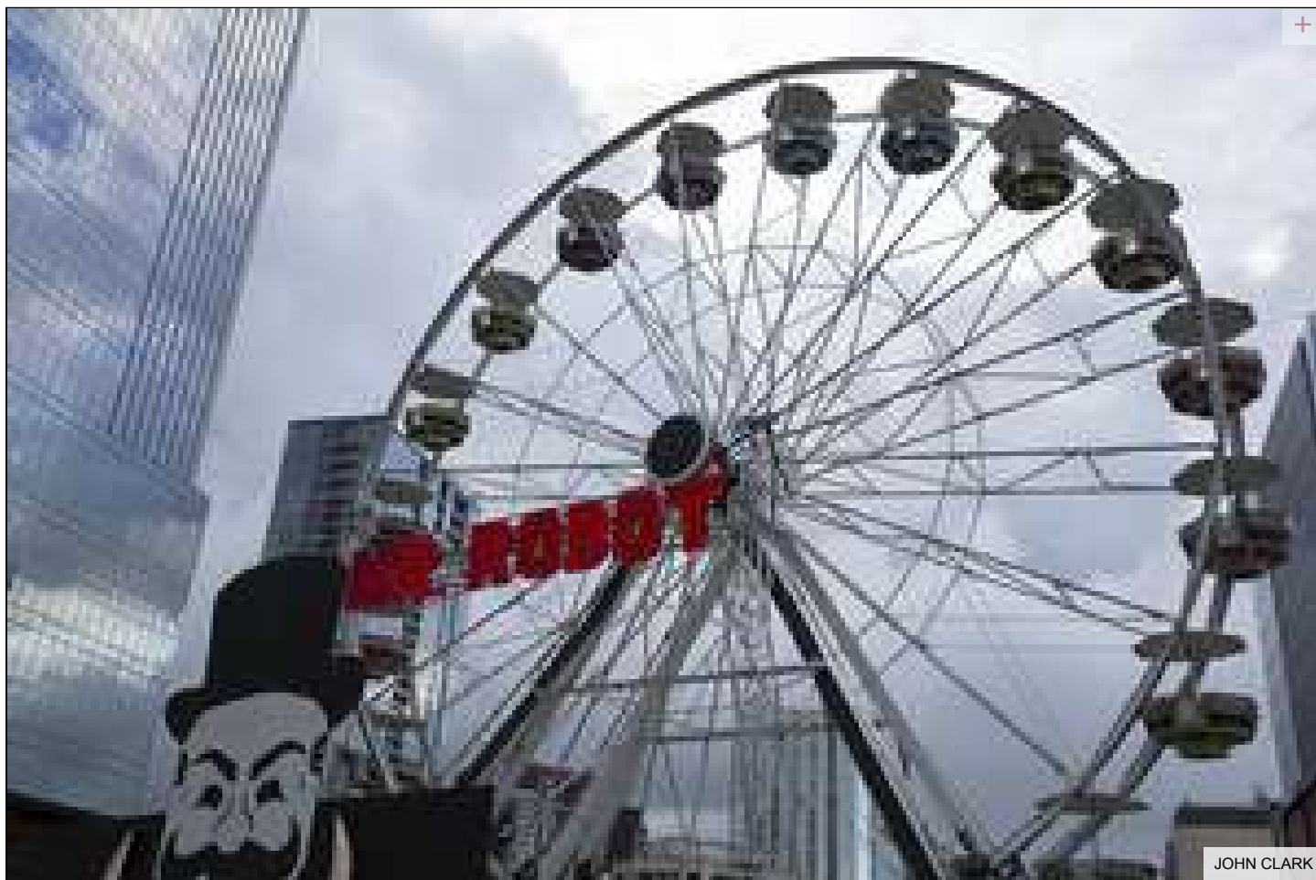
The Ferris wheel at South by Southwest was a promotion for the TV show "Mr. Robot," a show about cybersecurity.

Research from the Geena Davis Institute on Gender and Media about "Gender Bias Without Borders" shows that, "Men outpace women in on-screen STEM career roles 7-1." The only mainstream female STEM character I know about is Abby Sciuto, the goth fashion plate, tech genius and basement lab guru from popular television show "NCIS."