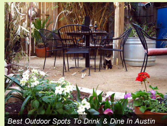
Best Outdoor Spots To Drink & Dine In Austin